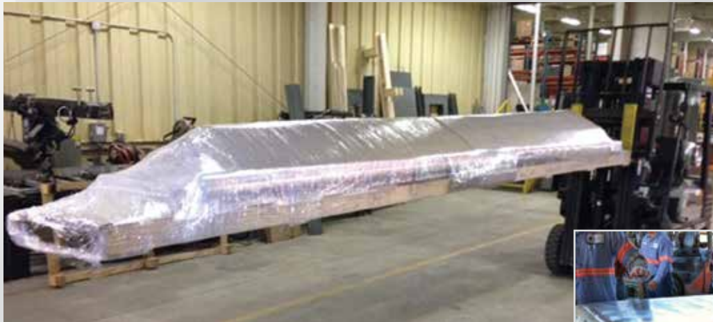
For rods, bars, profiles and other other long products, the TAB Wrapper Tornado can wrap products of virtually unlimited lengths.