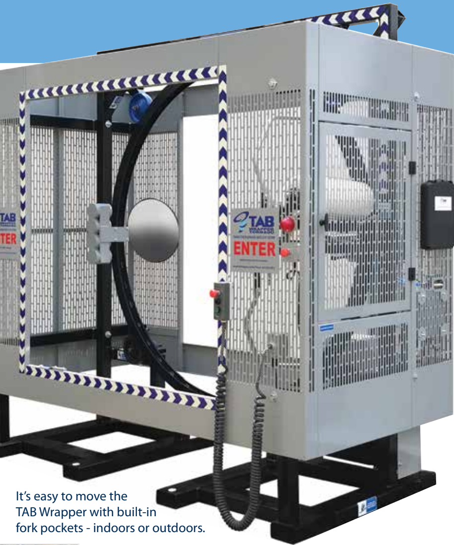
It's easy to move the TAB Wrapper with built-in fork pockets - indoors or outdoors.