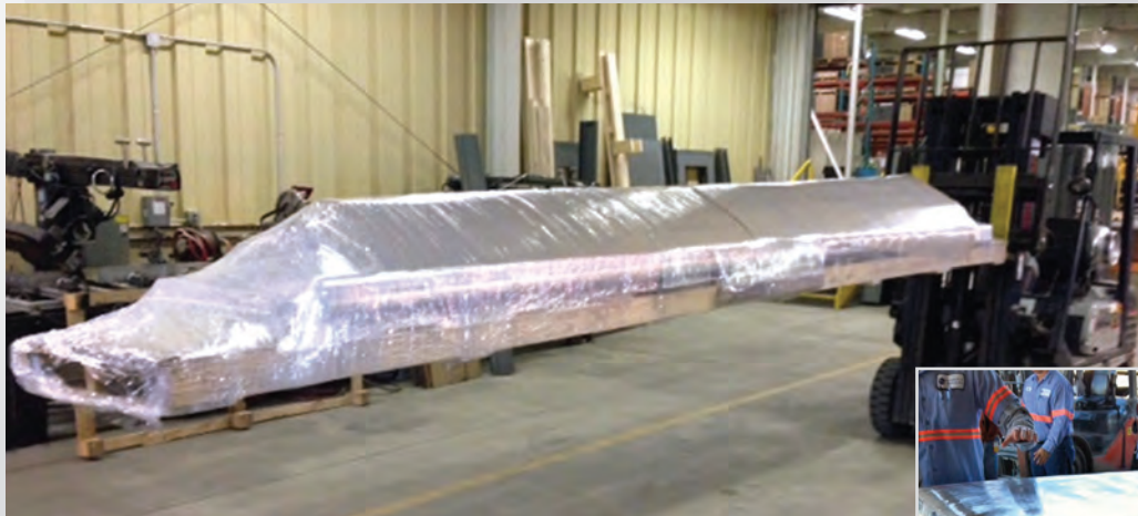
For rods, bars, profiles and other other long products, the TAB Wrapper Tornado can wrap products of virtually unlimited lengths.