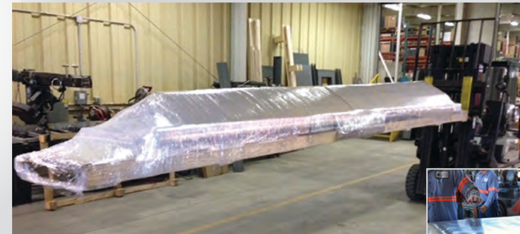
For rods, bars, profiles and other other long products, the TAB Wrapper Tornado can wrap products of virtually unlimited lengths.